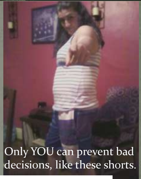
Only YOU can prevent bad decisions, like these shorts.