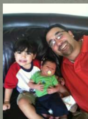
Hopefully, a number 8 in the making!