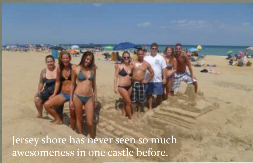
Jersey shore has never seen so much awesomeness in one castle before.