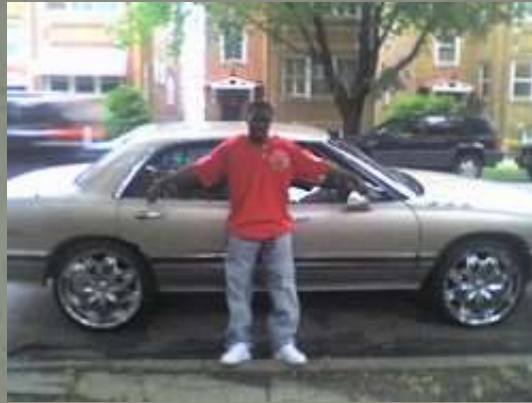
*Not intended to be a factual representation.